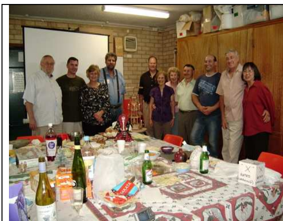
The illustrious 'group'!

It was a great night and a great way to finish up the year with friends who all share the same passion. I have included some photos from the night.