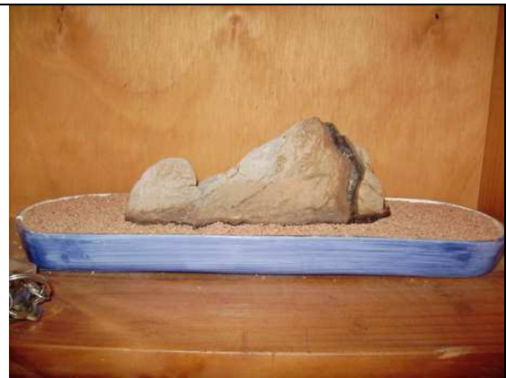
Mountain stone with waterfall

Club meetings for 2010 will be held at the Don Moore Community Centre, North Rocks Road, North Rocks at 7.30pm. They are as follows and they coincide with school terms. Everyone is welcome.