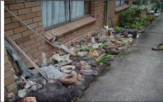
Just one section of stones in the garden

Some photos from the tour of Ron's collection-