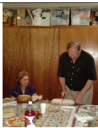
Cutting the Stollen