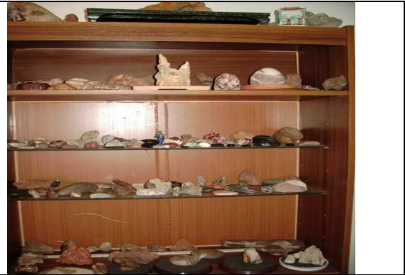
Some of the stones inside the 'stone' room