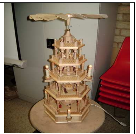
German Xmas decoration